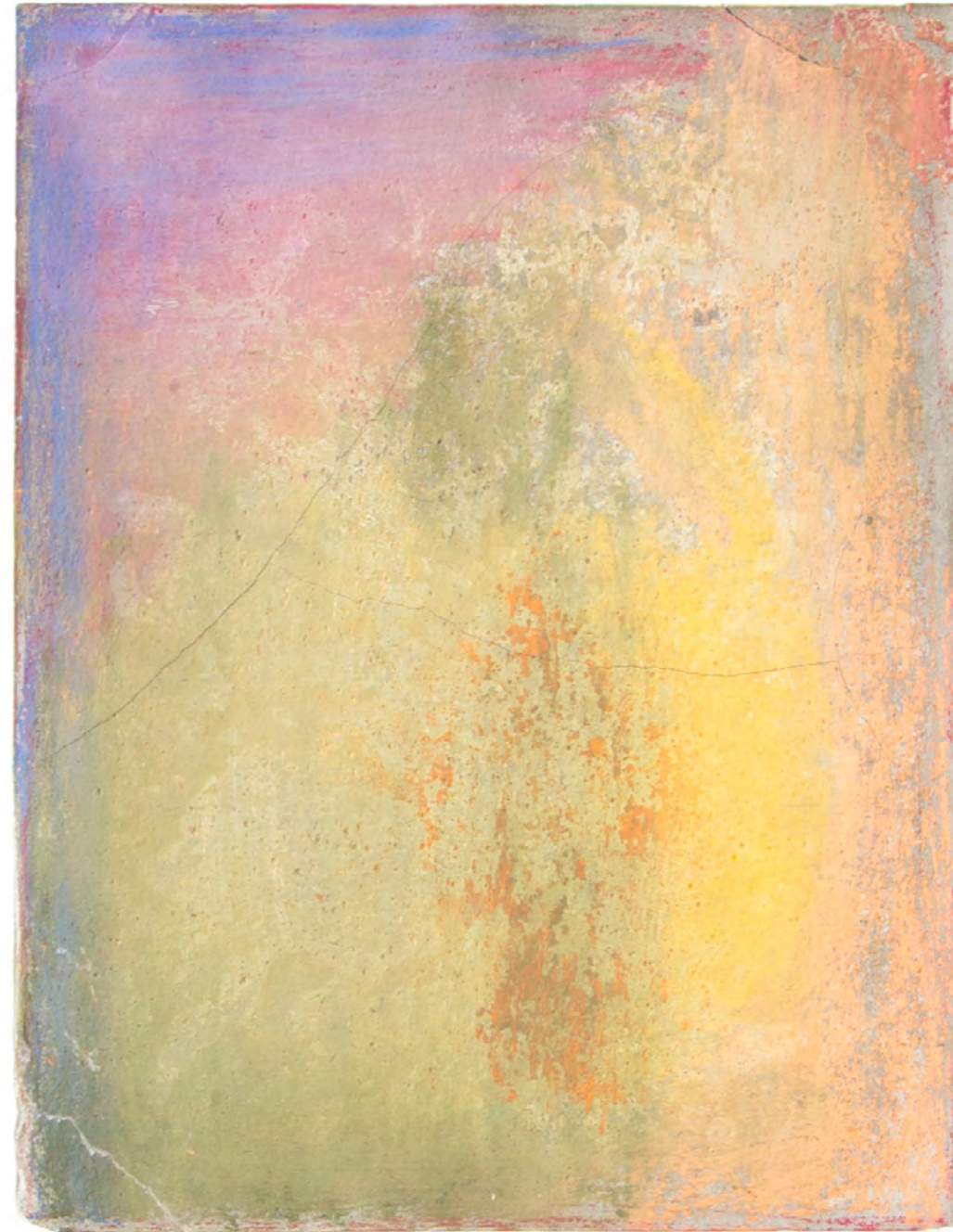
Untitled 2024 concrete, spray-paint, crayon, laquer, wood, 36,5 x 34,5 cm