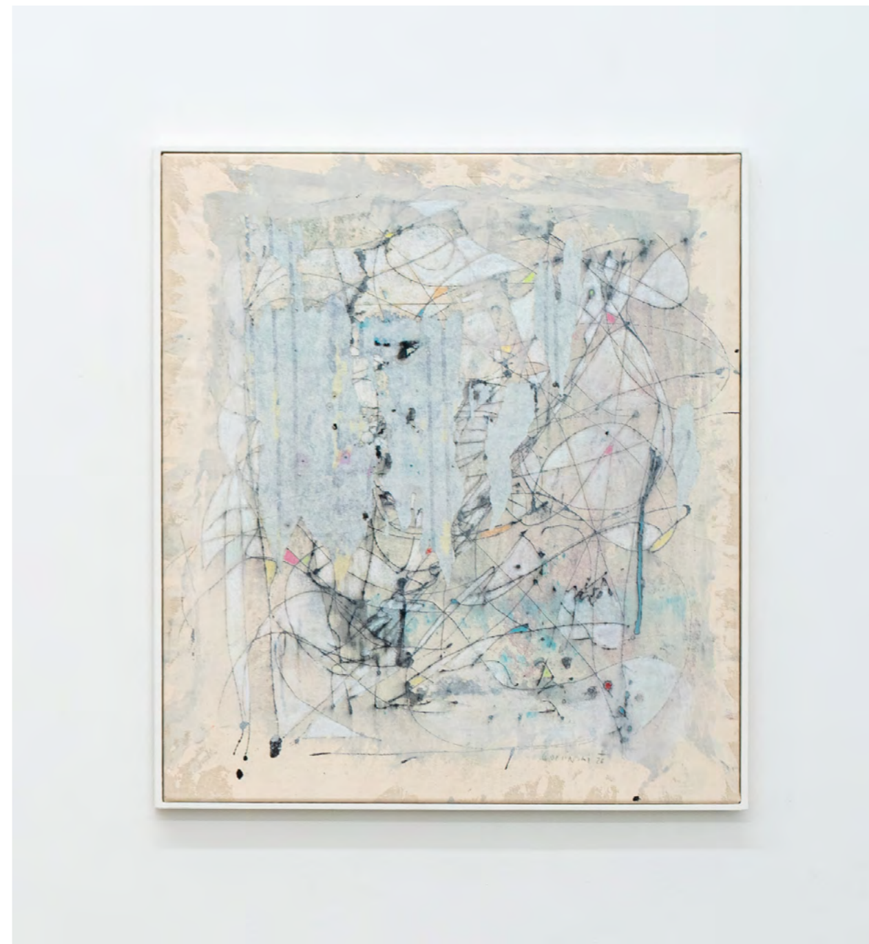
Untitled 2026 ,acrylic, crayon, ink on canvas, 54 x 48 cm