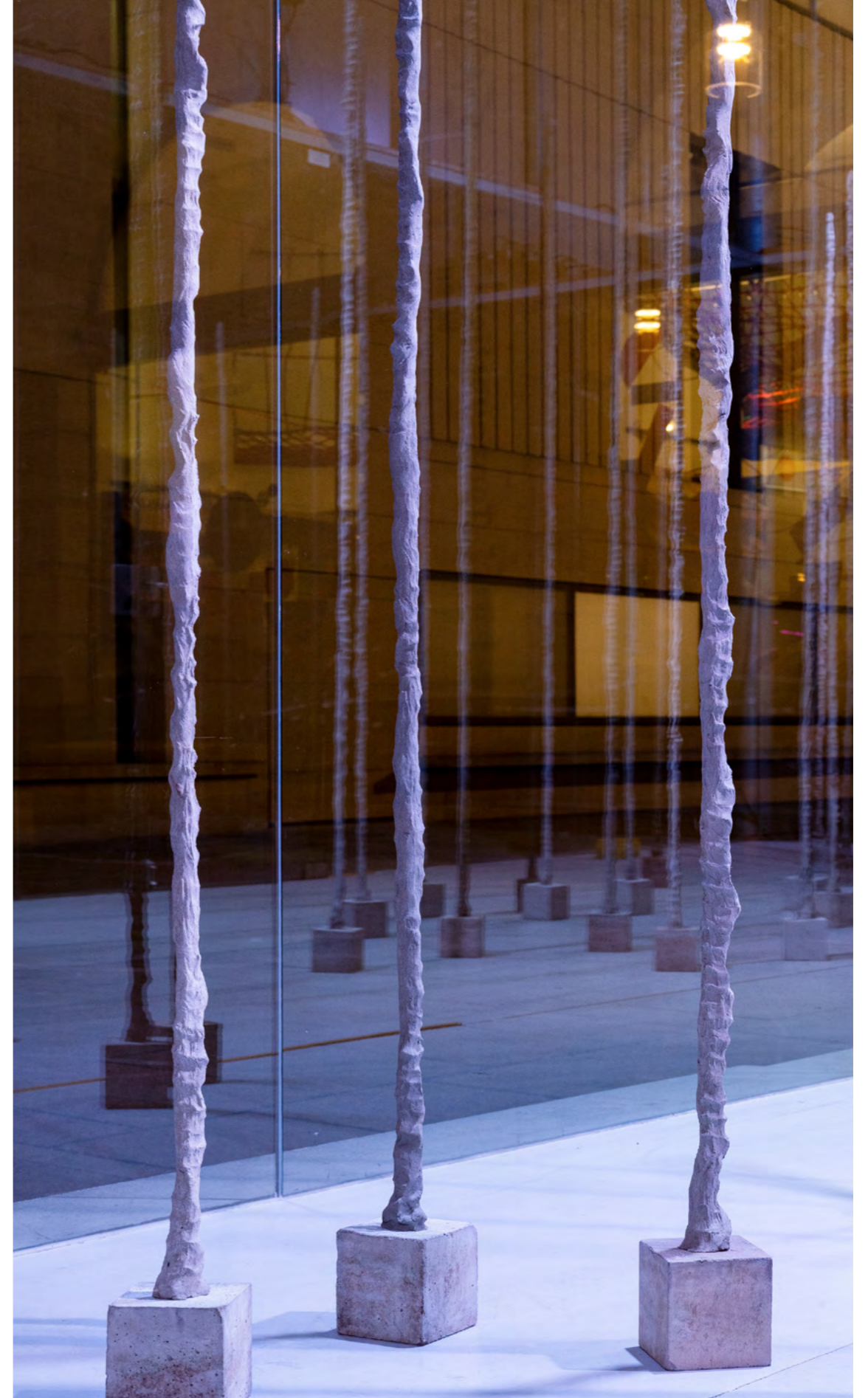
Desert Plants 2018 - ongoing Installation view MQ Art Box, Museumsquartier, Vienna, 2024/25 concrete, iron / bronze approx. 250 x 10 x 10 cm