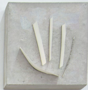
Untitled 2025, concrete, paper, 18 x 18 x 7cm