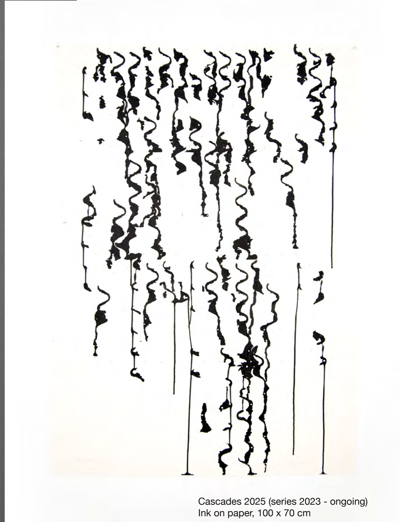
Cascades 2025 (series 2023 - ongoing) Ink on paper, 100 x 70 cm