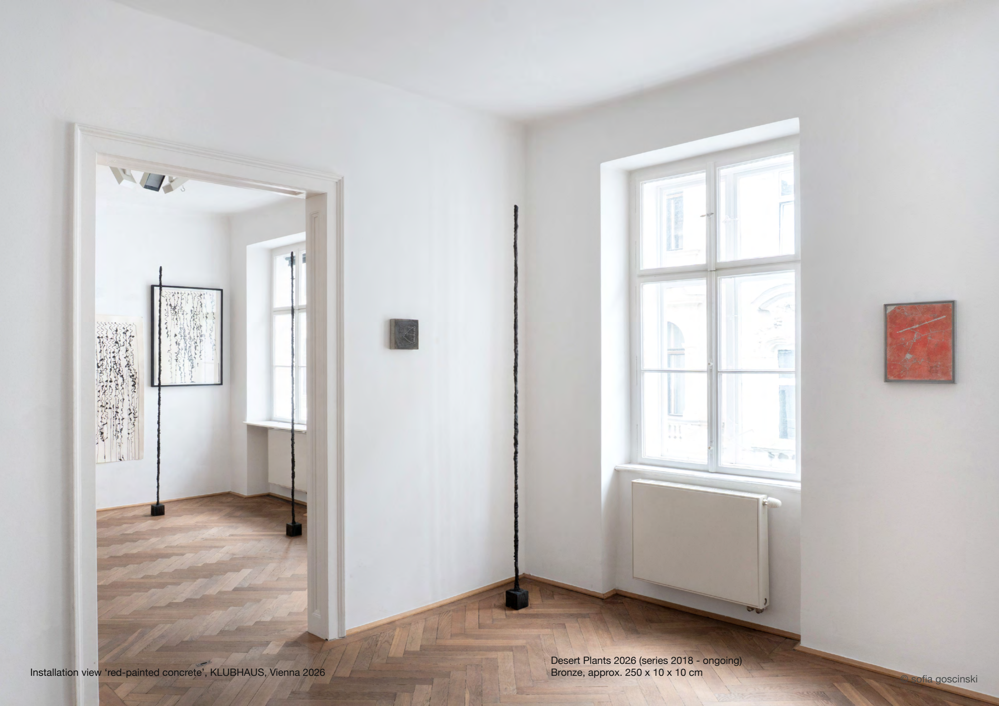
Installation view 'red-painted concrete', KLUBHAUS, Vienna 2026