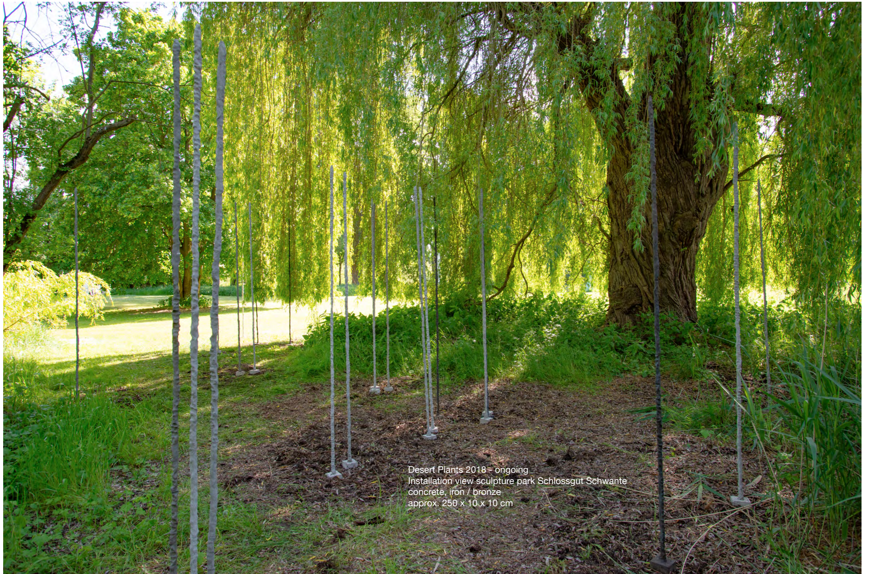
Desert Plants 2018 - ongoing Installation view sculpture park Schlossgut Schwante concrete, iron / bronze approx. 250 x 10 x 10 cm