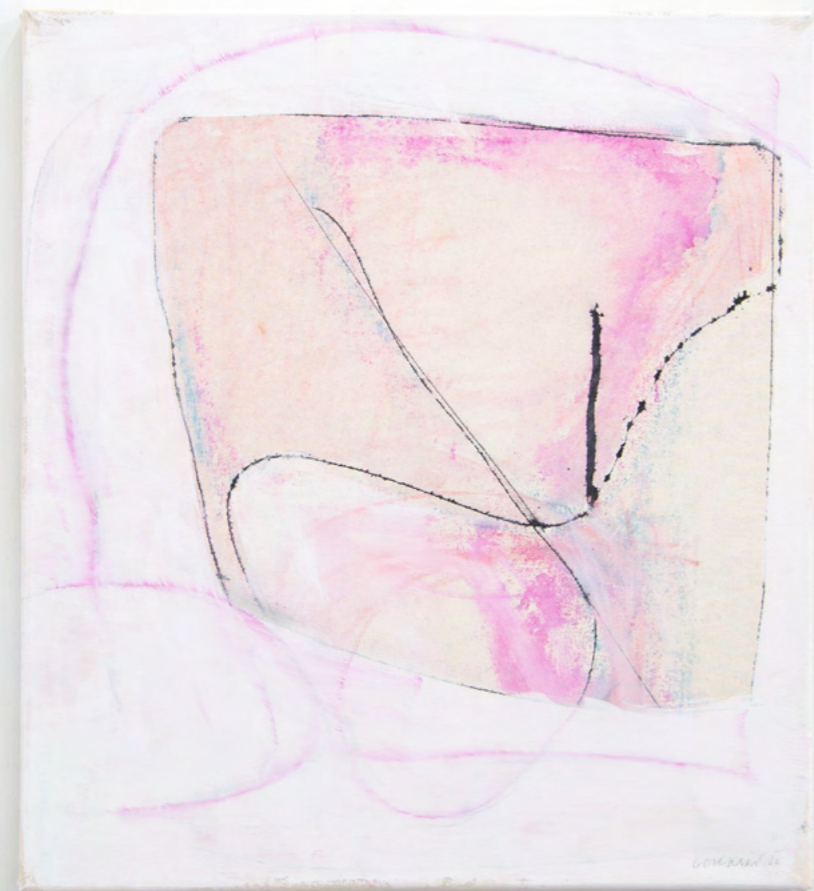
DO 2026, ink, acrylic, crayon on canvas, 48 x 43 cm