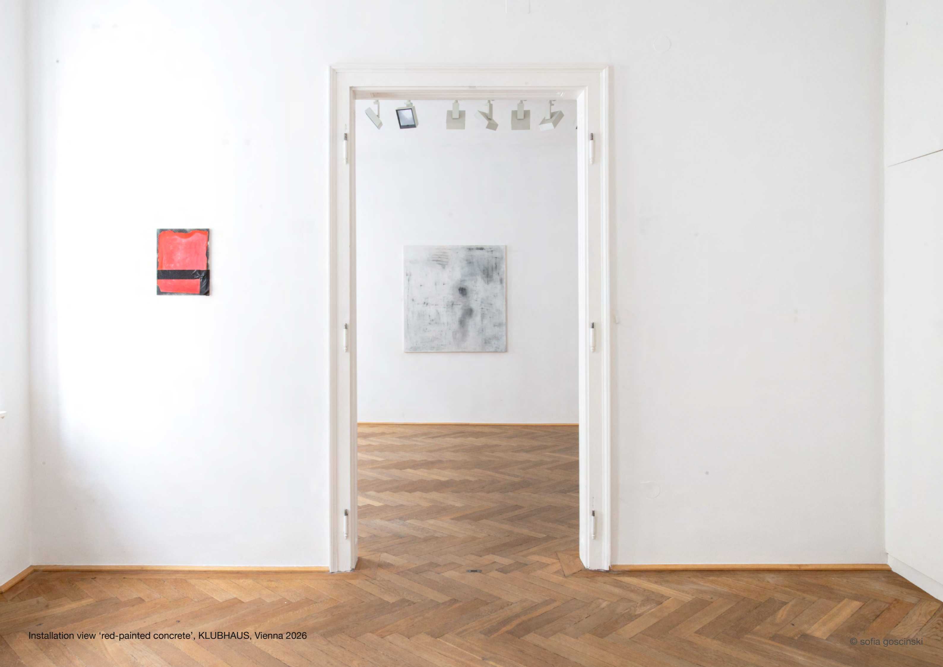
Installation view 'red-painted concrete', KLUBHAUS, Vienna 2026