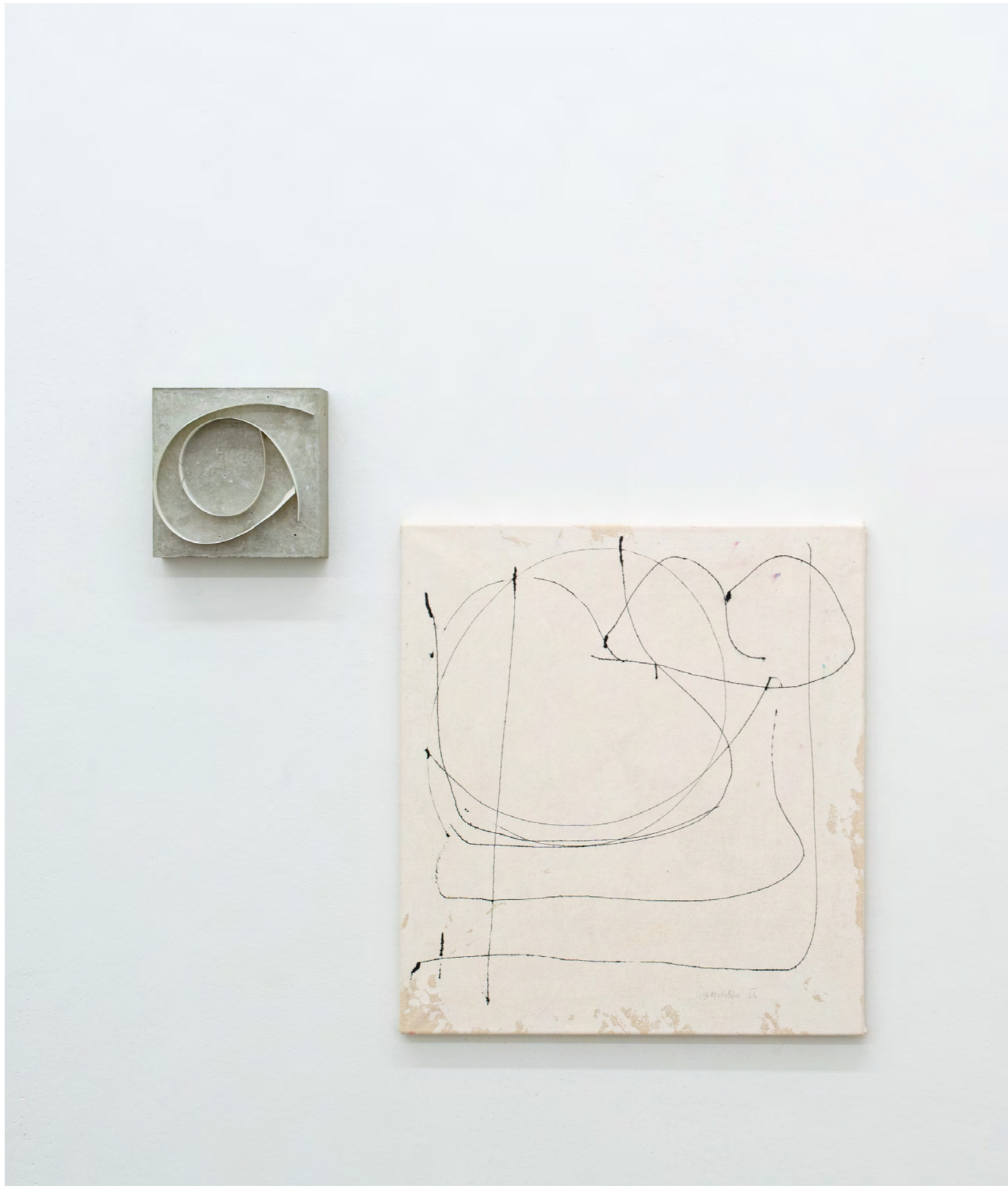
Little Creature 2025, ink, acrylic on canvas, 55 x 50 cm