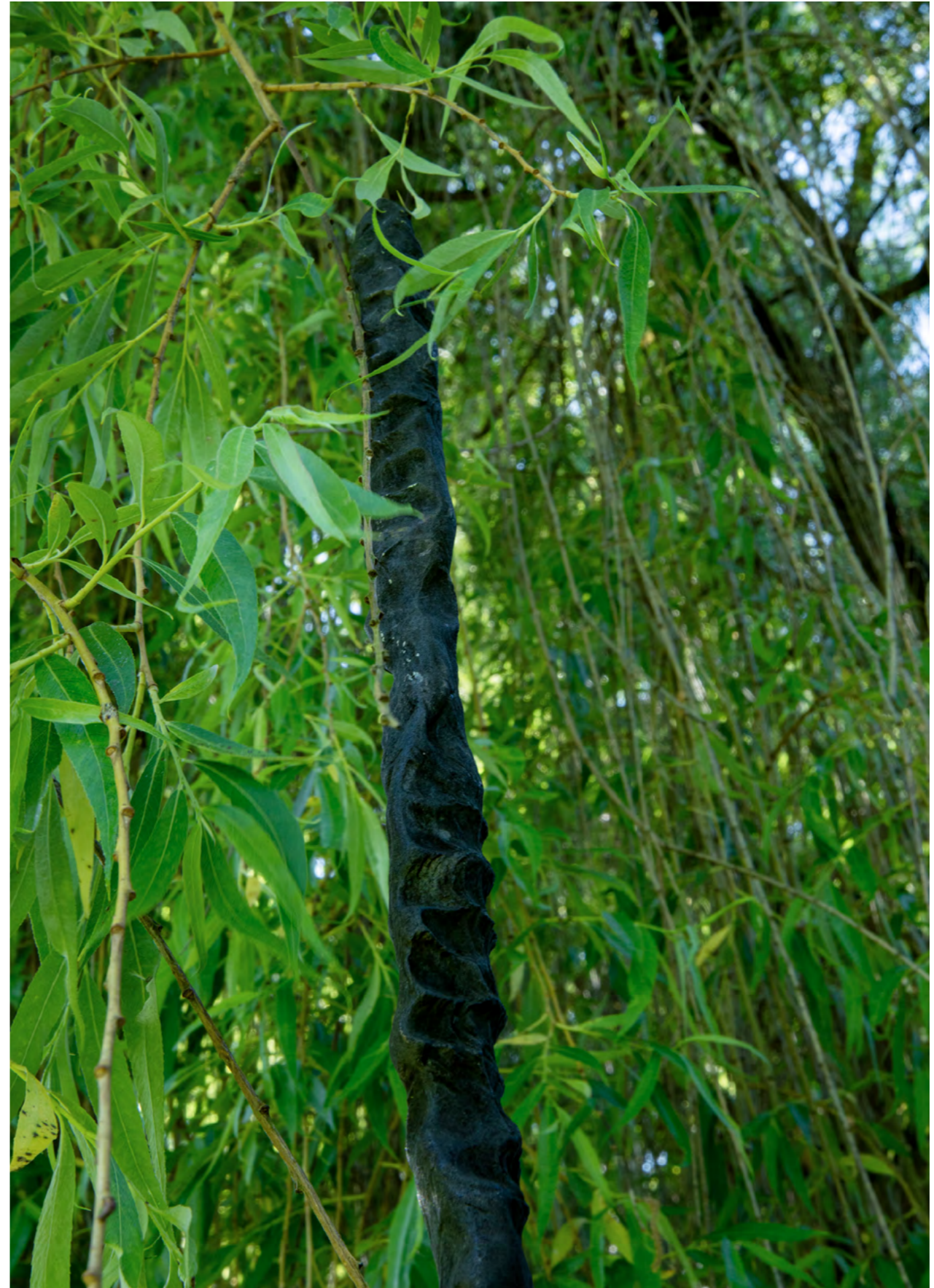
Desert Plants 2018 - ongoing Installation view sculpture park Schlossgut Schwante concrete, iron / bronze approx. 250 x 10 x 10 cm