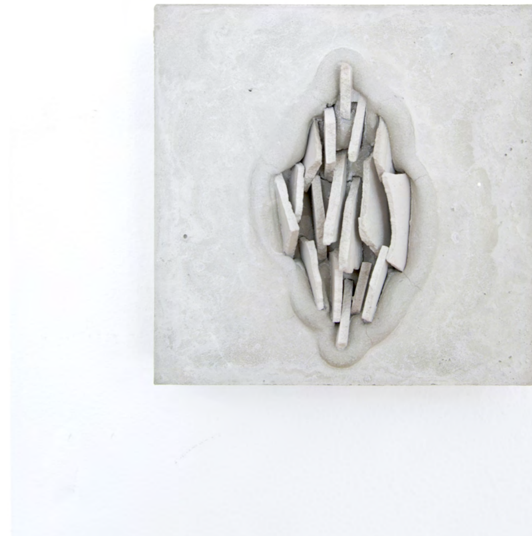
Barrikaden 2025 (series 2023 - ongoing) concrete, 18 x 18 x 6,5 cm