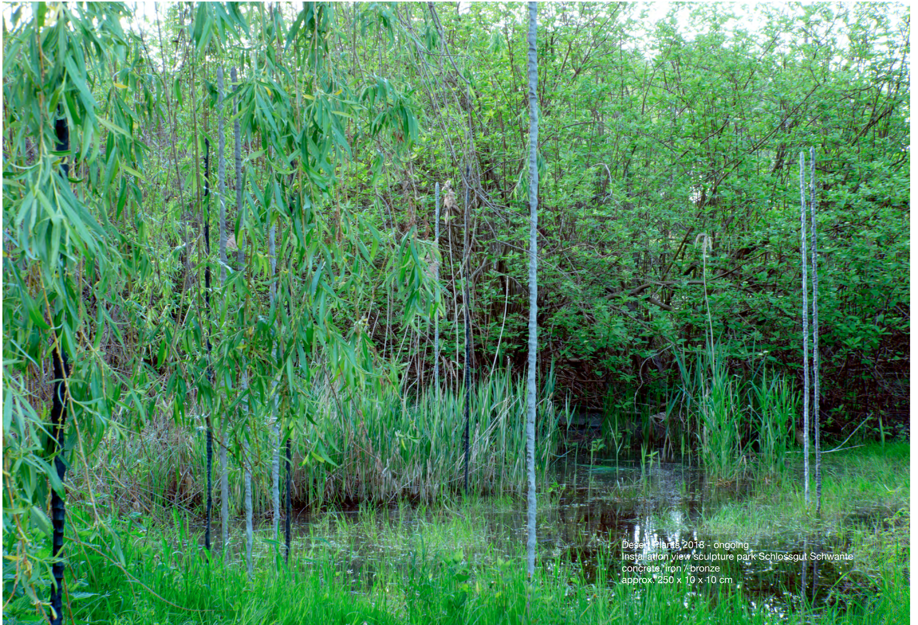
Desert Plants 2018 - ongoing Installation view sculpture park Schlossgut Schwante concrete, iron / bronze approx. 250 x 10 x 10 cm