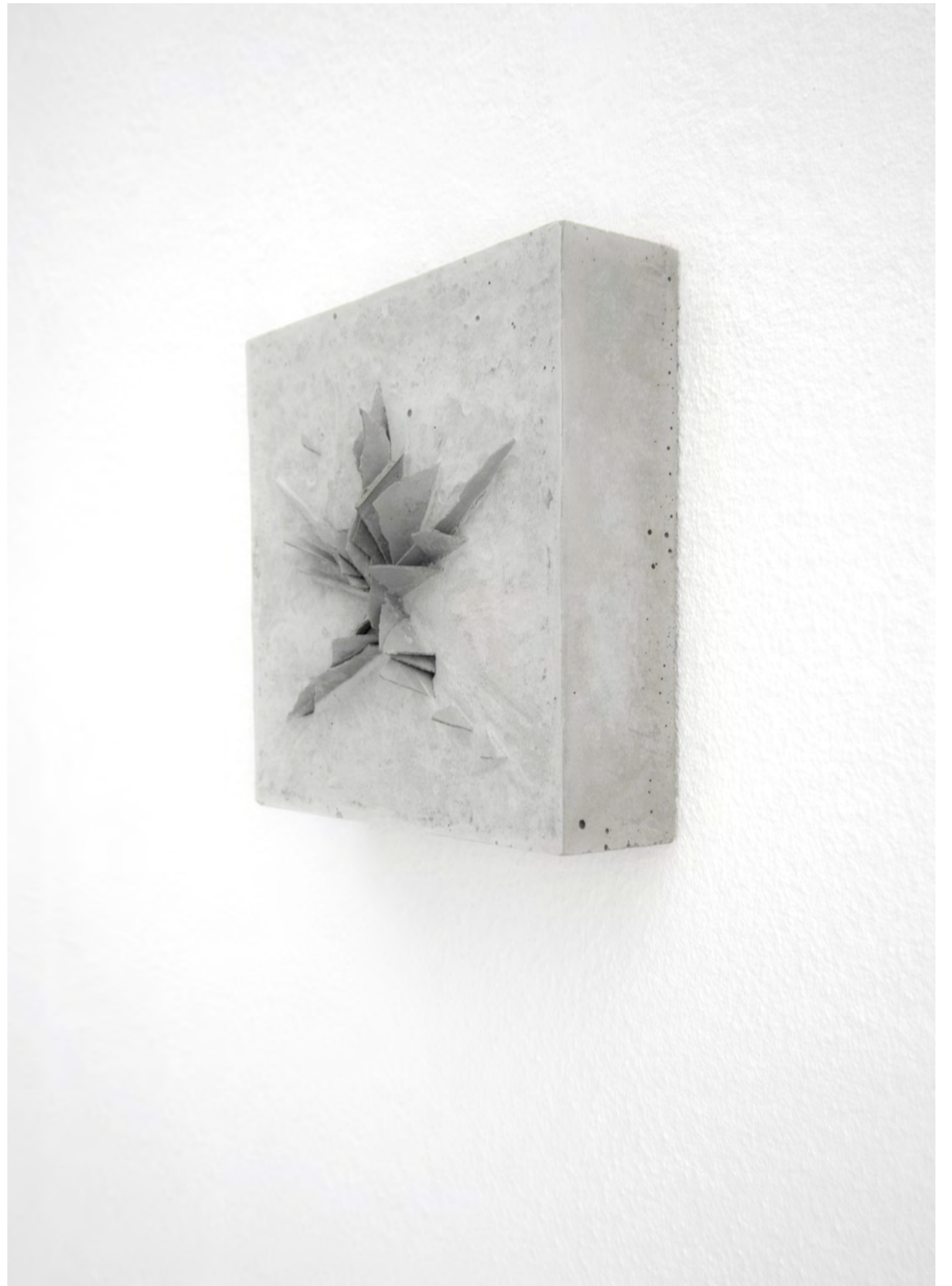
Barrikaden 2023 (series 2023 - ongoing) concrete, 18 x 18 x 7 cm