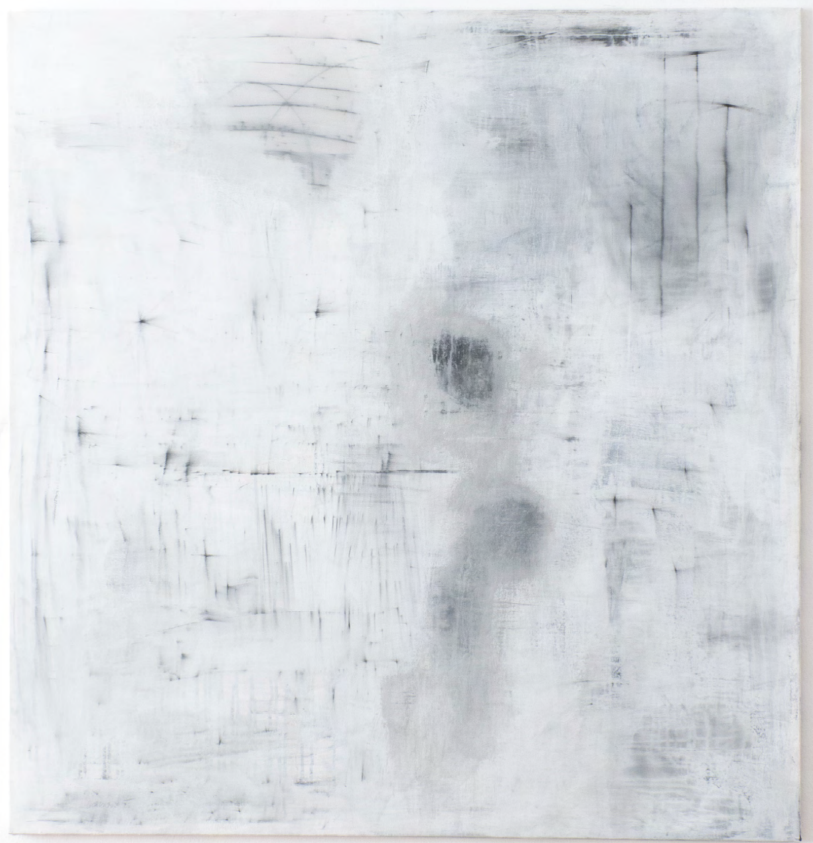
I See the Winter 2025 Ink, acrylic on canvas, 120 x 115 cm