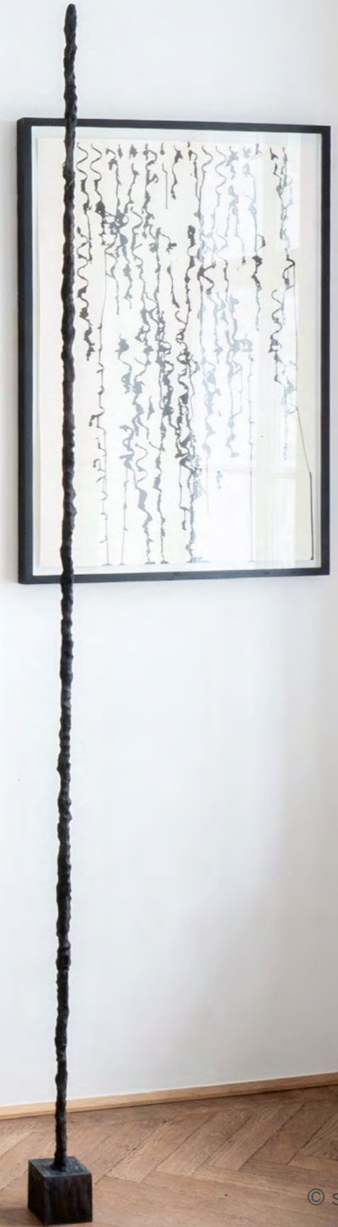
Desert Plants 2026 (series 2018 - ongoing) Bronze, approx. 250 x 10 x 10 cm