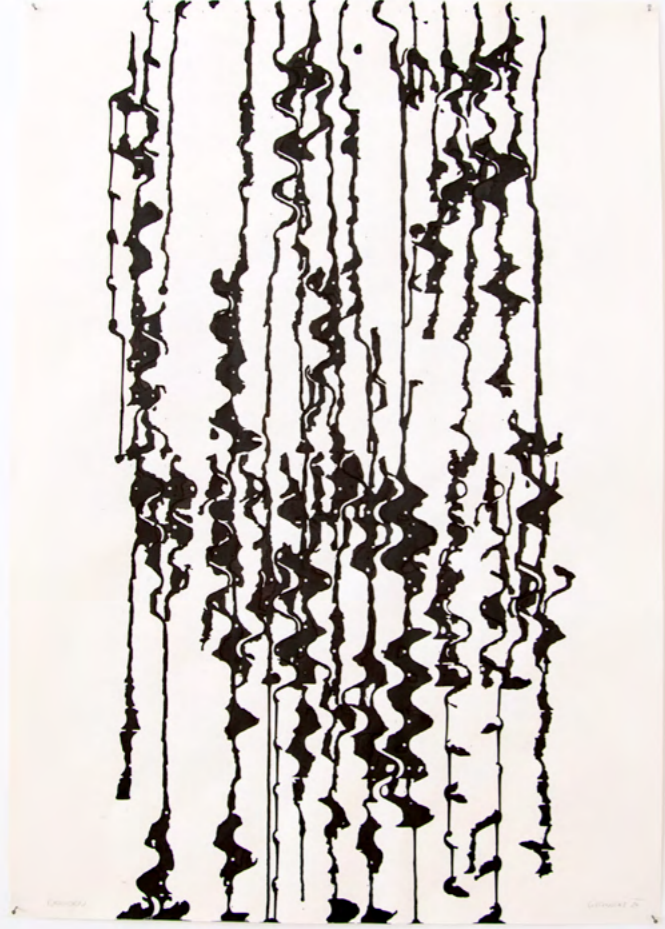
Cascades 2024 (series 2023 - ongoing) Ink on paper, 100 x 70 cm