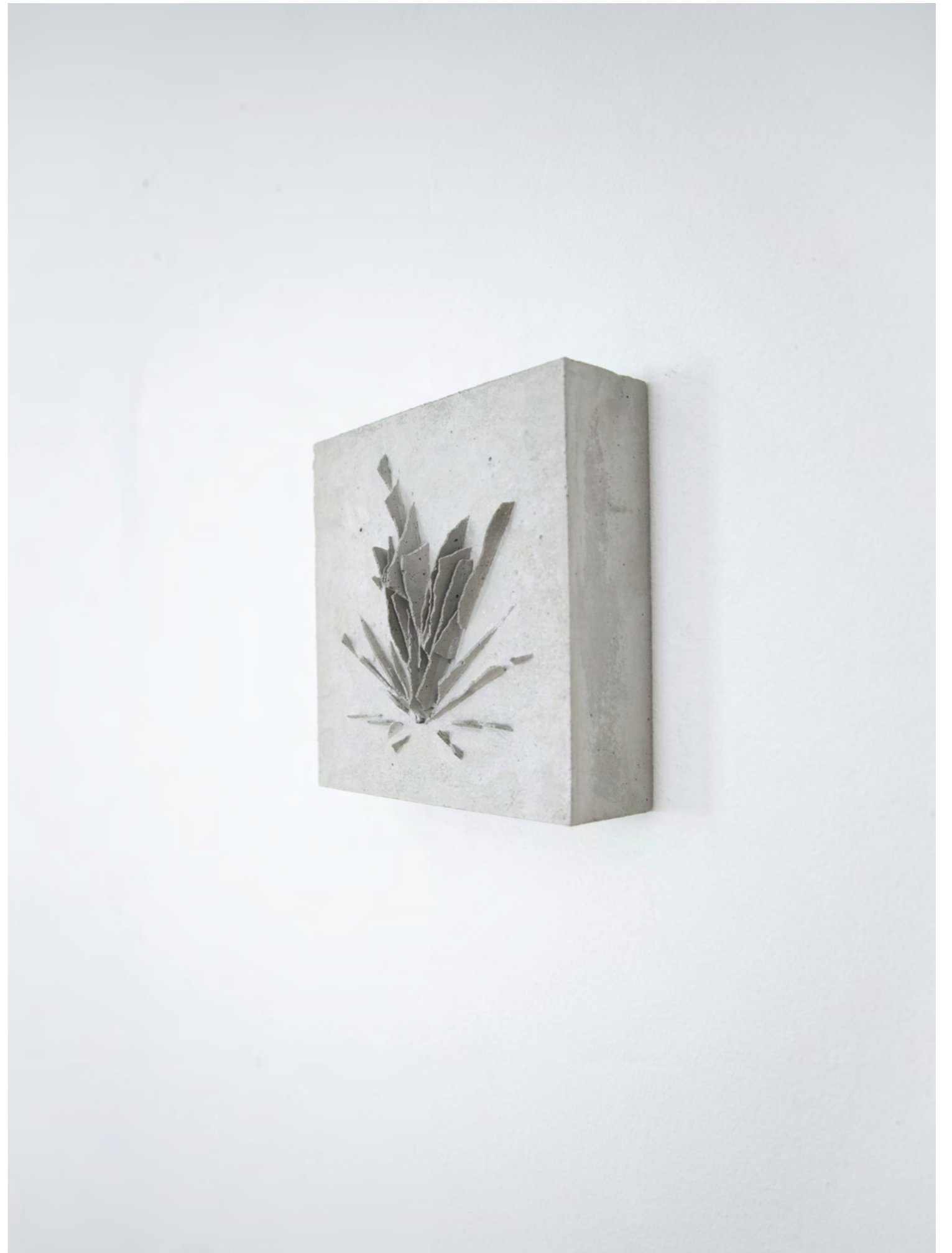
Barrikaden 2025 (series 2023 - ongoing) concrete, 18 x 18 x 6,5 cm