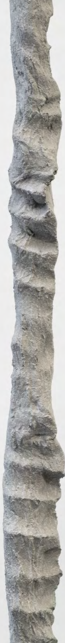
Desert Plant (detail)