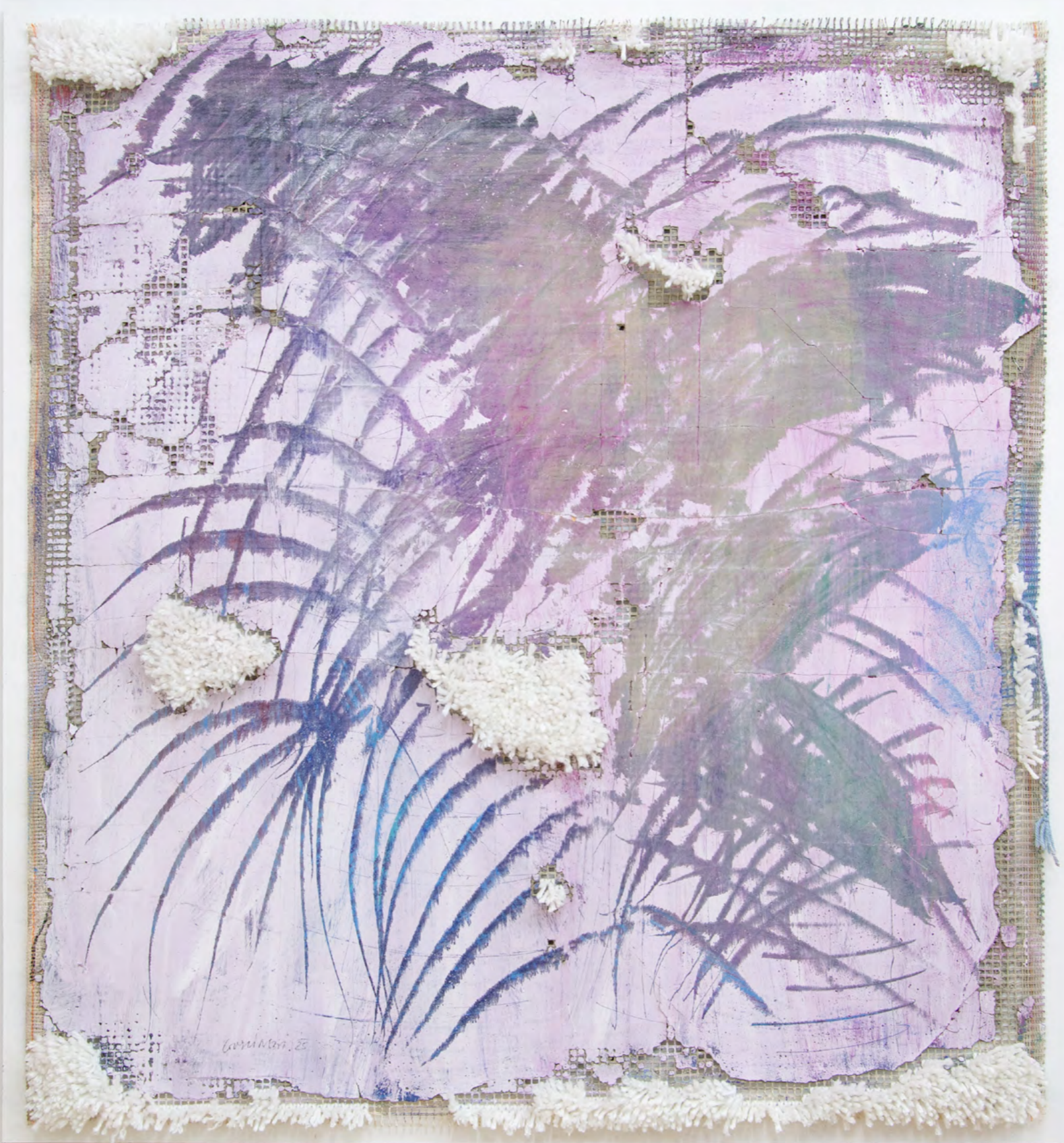
Snow in California (hard/soft series) 2026 Crayon, acrylic, spray-paint on textile-reinforced concrete, wool, 83 x 76 cm