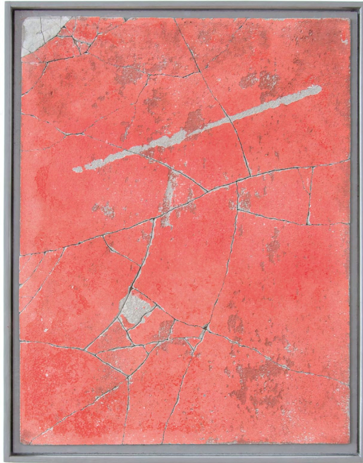
We stumble through messages 2024 Crayon, spray-paint on concrete, artist frame: wood, spray-paint, 37,5 x 29,5 x 3 cm