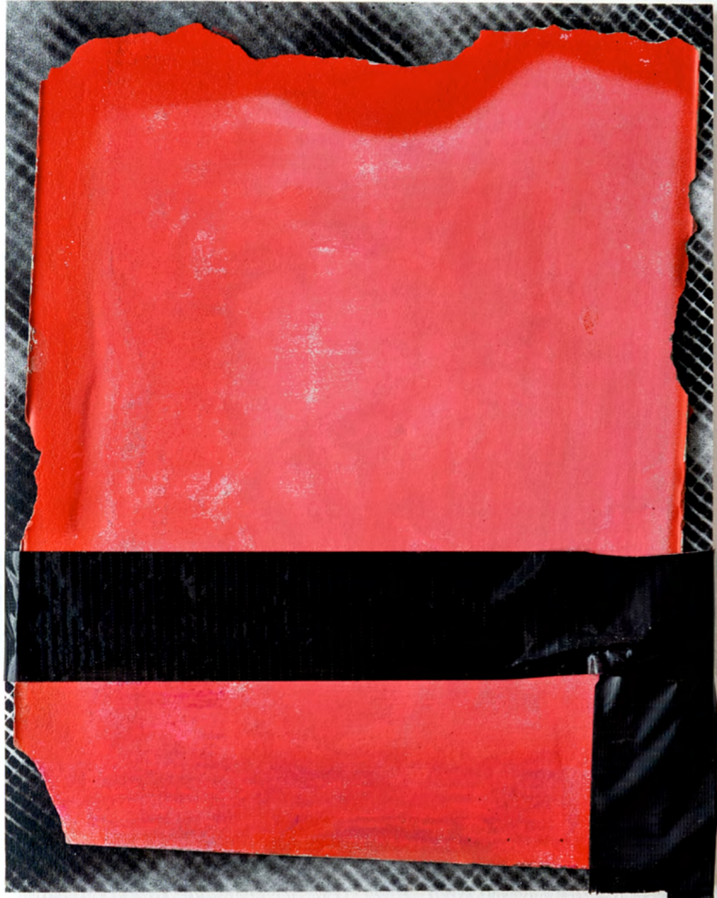
Rosemarie 2026 Crayon, spray-paint on concrete, spray-paint on wood, duct tape, 34 x 27 x 1 cm