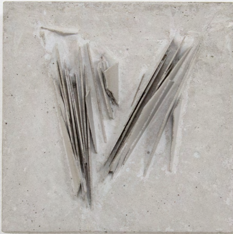
Barrikaden 2023 (series 2023 - ongoing) concrete, 18 x 18 x 7 cm