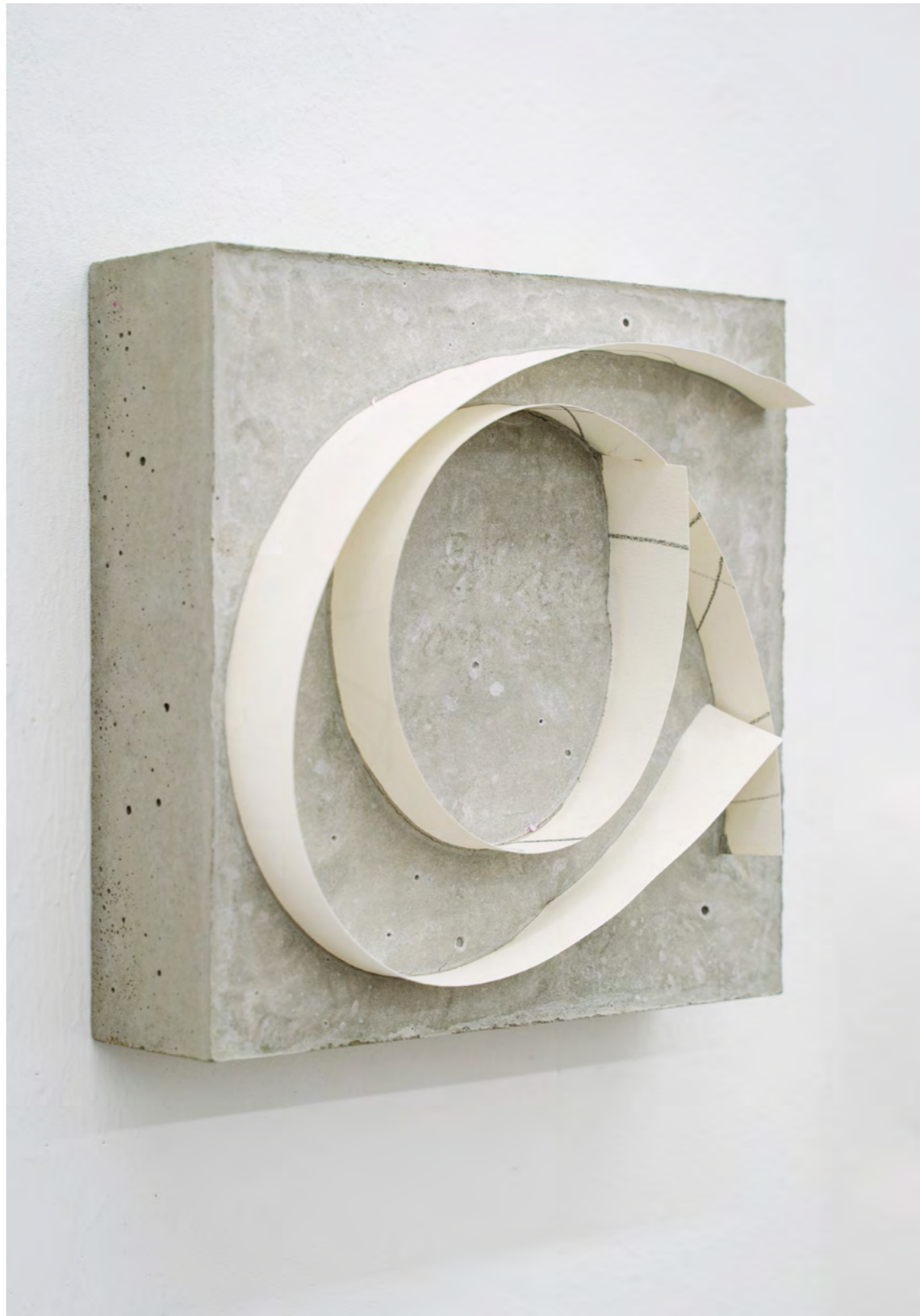
Untitled 2026 ,concrete, pencil on paper, 18 x 18 x 7cm